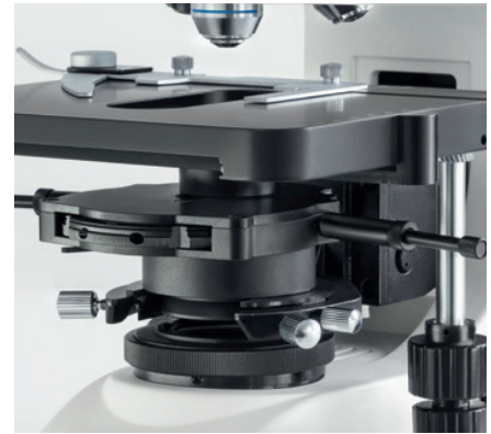
OBN-15: Mounted phase contrast condenser