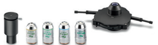
Quintuple PH universal rotary condenser with 10×/20×/40×/100× Infinity PH-Plan objectives (complete set, for OBN-15 included)